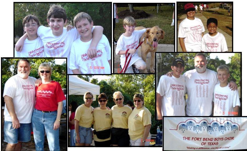
Scenes from our the Walk in Concert with the Fort Bend Boys Choir walk-a-thon benefiting our organization as well as Fort Bend Community Partners Rainbow Room on November 5, 2005 at Oyster Creek Park.

©2006 Vocal Notes is published twice a year for choristers, alumni and friends, by The Fort Bend Boys Choir of Texas, Inc: a non-profit, tax exempt organization incorporated by the State of Texas. Inquiries or address changes should be sent to: Editor • P.O. Box 2042 • Stafford, Texas 77497-2042 • (281) 240-3800.